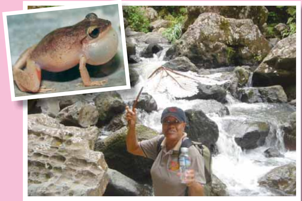
Tour Guide demonstrating how a leaf can be used instead of an umbrella in the rainforest.

We're heading next to Puerto Rico, an island nation which is a territory of the United States. Its inhabitants have been United States citizens since 1917. Before Christopher Columbus discovered the island on his second voyage, Puerto Rico was called Borinquen. He then named it San Juan (the name of the capital today) for St. John the Baptist. It was later renamed Puerto Rico meaning rich port!