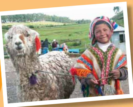
Typical Peruvian clothing.

Round the currency to the nearest whole number. Using the exchange rates chart, make up five math word problems based on the information. Make a separate answer sheet and then exchange your problems with another classmate.