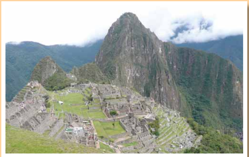
The ruins of Machu Picchu, a sacred place for the Incas.